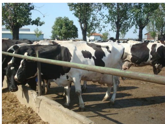
Figure 3. View from a Dairy Farm in the NE part of Romania